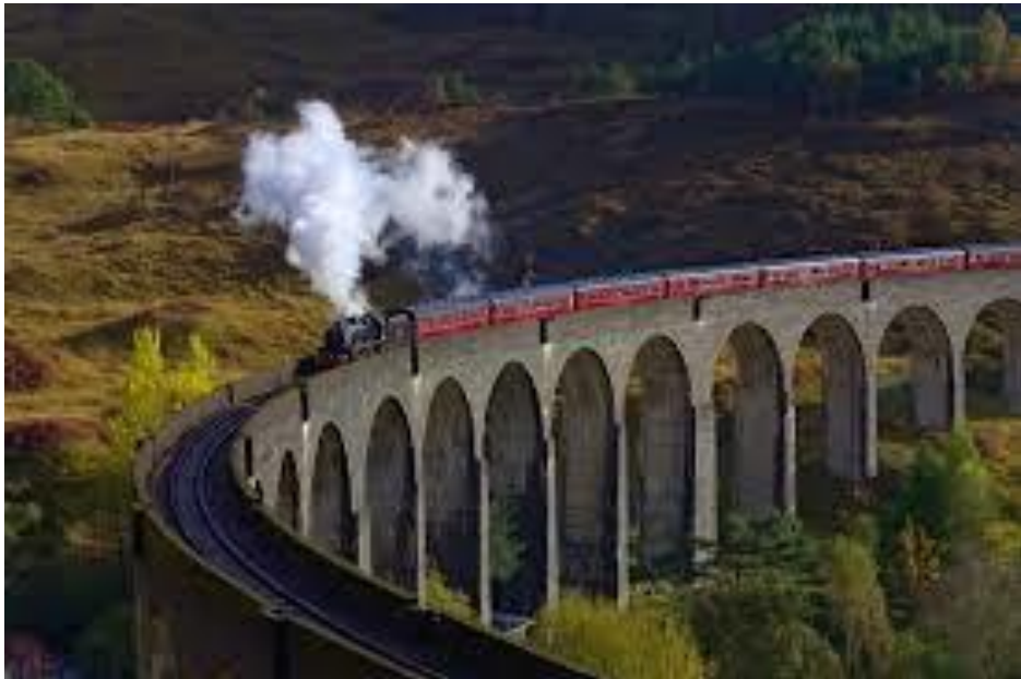
The Jacobite Steam Train on Glenfinnan Viaduct Bridge