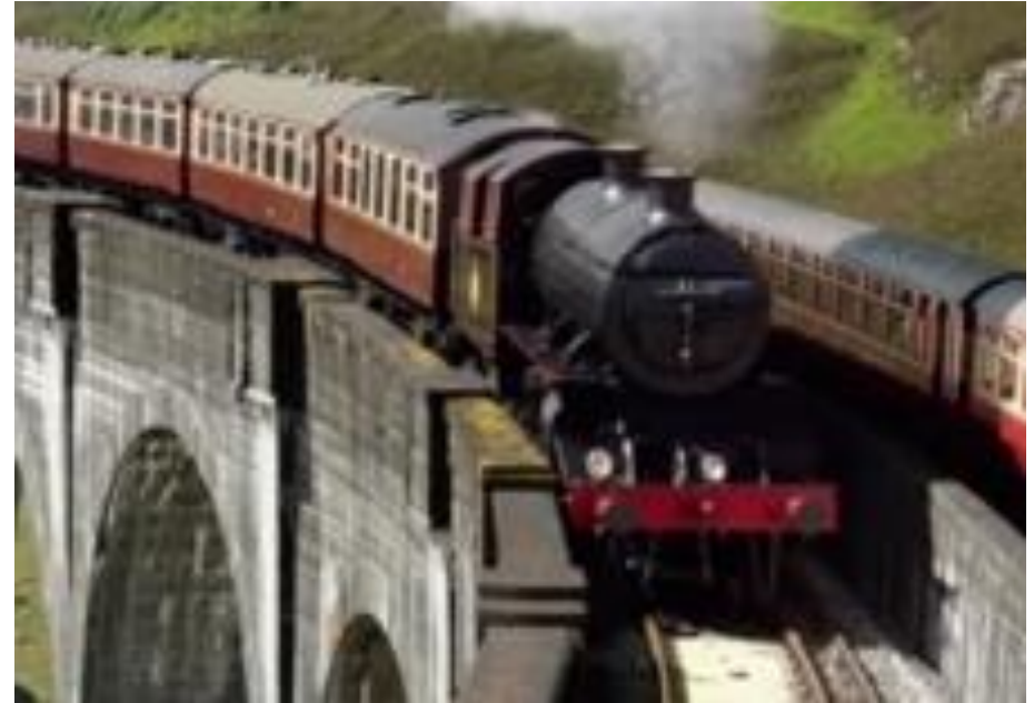
A screenshot from a video generated by artificial intelligence Sora